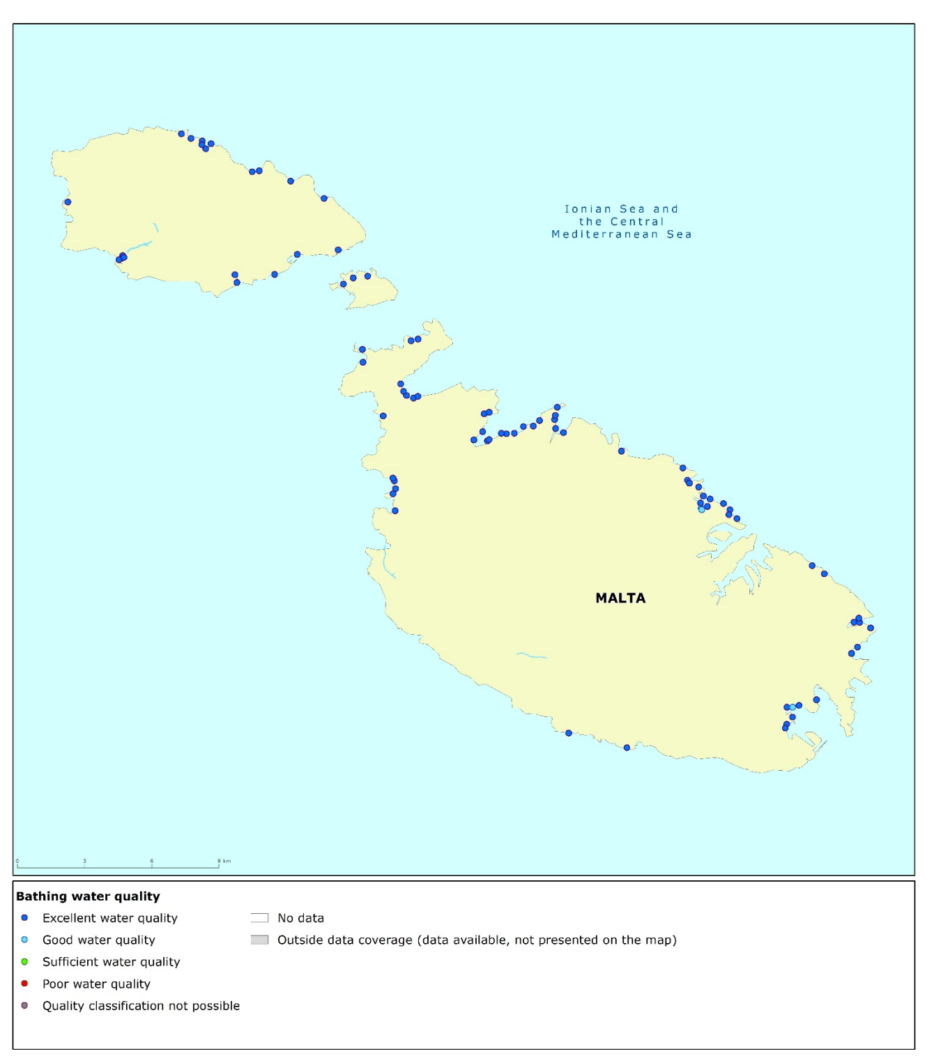
Map 1: Bathing waters reported during the 2020 bathing season in Malta

Source: National boundaries: EEA; Large rivers and lakes: EEA, WFD Article 3; Bathing waters data and coordinates: Maltese authorities; Digital Elevation Model over Europe (EU-DEM): EEA.